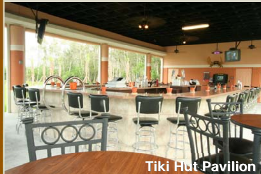
Tiki Hut Pavilion

The project was completed more than 30 days ahead of schedule which allowed the Lodge to open earlier than expected. This along with staying well with in budget made it a very successful project for all those involved.