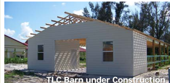
TLC Barn under Construction

TLC is a christian based home founded to keep siblings together when an unfortunate situation arises that separates children from their parents. The families of the children are facing some type of crisis that results in their inability to care for them. At times these children are presented to TLC with nothing but the clothes on their back.