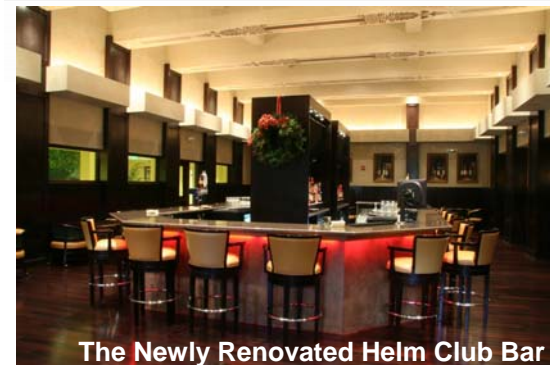
The Newly Renovated Helm Club Bar